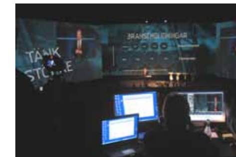
Stage & Rental